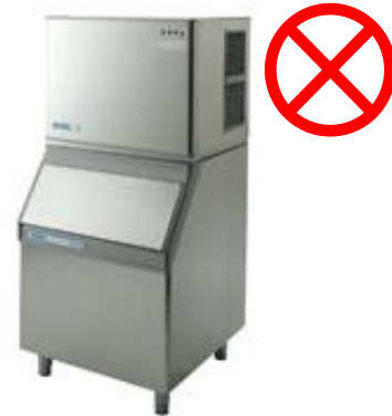
Figure14: Bulk/chest ice making units

Frequent cleaning and mild disinfection of portable ice chests and containers is recommended and should be part of operational procedures - while regular ice making machine maintenance is important for appropriate performance. Accordingly, appropriate policies and procedures based on operational and maintenance manuals should be adhered to and verified on a regular basis.