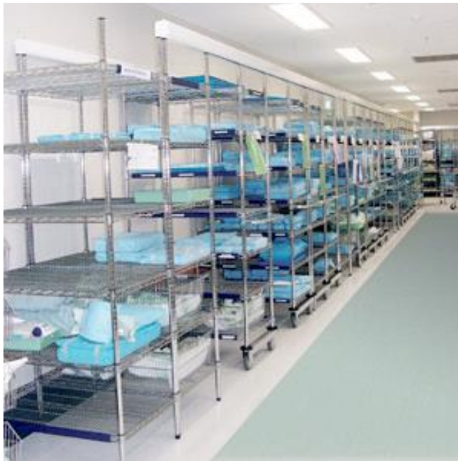
Figure 10: no sinks or hand basins in sterile stock storage areas

Sinks or handwash basins should NOT be provided in sterile environments, such as sterile stock storage areas. Clinical handwash basins should be located external to such areas to avoid any cross-contamination risk.