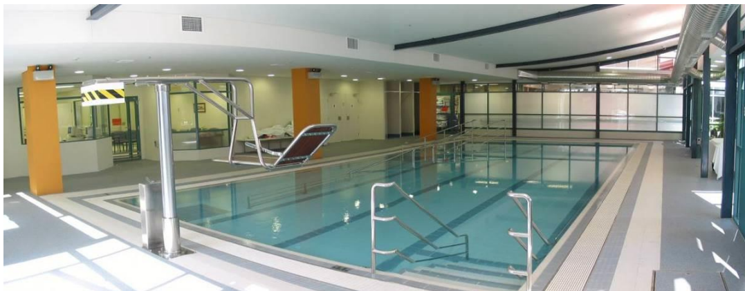
Figure 12: Hydrotherapy pool

Also refer to Part E - Engineering Services of these Guidelines.