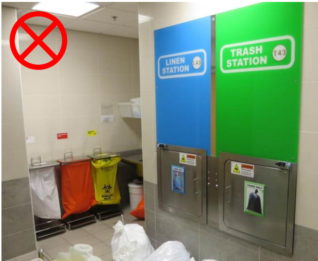
Figure 16: Linen and Waste chutes are not permitted

Chutes to move clinical, non-clinical, related wastes and dirty linen are not permitted because of the risk of spillage and unnecessary exposure to infection.