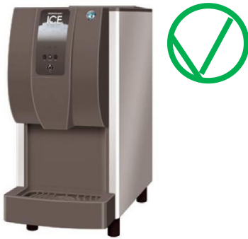
Figure 13: Benchtop dispensing ice making unit