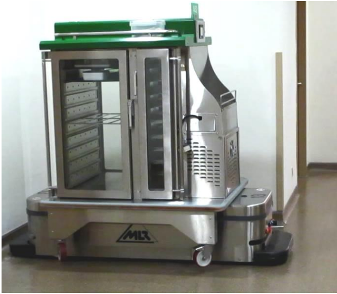
Figure15: Typical AGV with a supply trolley